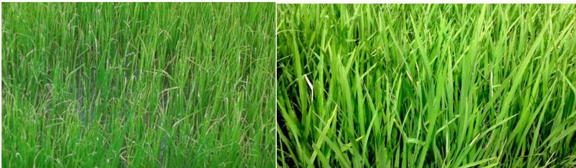
Case worm damage in nursery

Pest Status: Low to moderate incidence of case worm with 5.8 per cent mean damage in the main field on variety CR 1009 and 2-9 per cent damage in nursery on CO51.